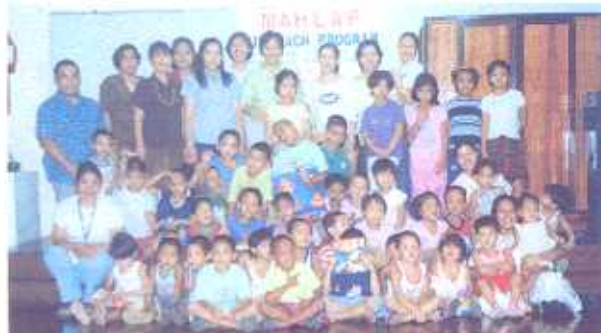
MAHLAP Officers with little angels of the Hospicio de San Jose